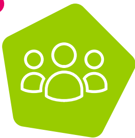
Leading a team