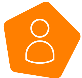
Supporting people who display behaviours of concern