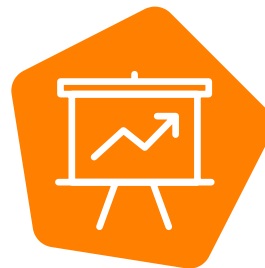
Development and learning