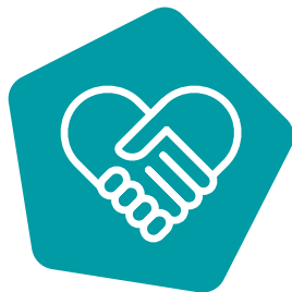
Maintaining standards of care